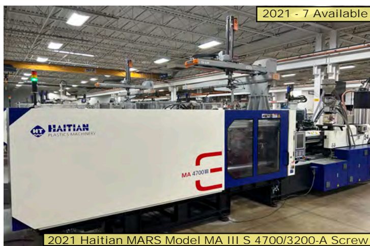
2021 Haitian MARS Model MA III S 4700/3200-A Screw