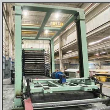
PLATEN DRYING OVEN WITH SLAB LOADER