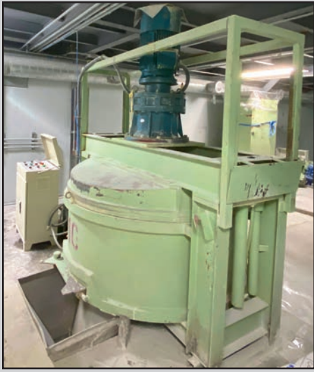
(1 OF 3) SINGLE DRIVE VARIABLE SPEED SLURRY MIXERS