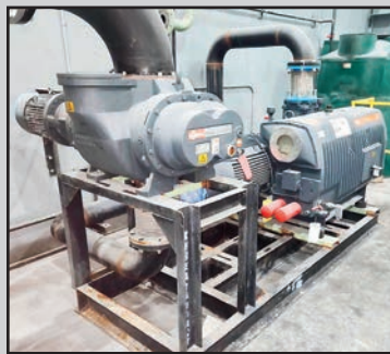
BUSCH TWIN VACUUM PUMP ON SKID