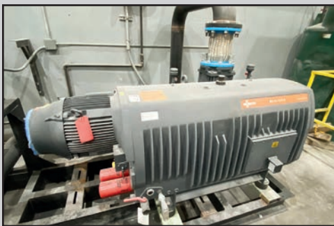
BUSCH VACUUM PUMP ON PRESS

Complete Cooling, Transfer, Hydraulic Loading And Take-Off System, with hydraulic turn-over.