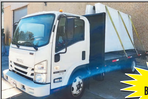
ISUZU FLATBED TRUCK

Over 1,000 Tons of Raw Materials Including Crushed Quartz and Quartz Grain, Quartz Silica, Assorted Parts, Supplies, and Stores and Much More!