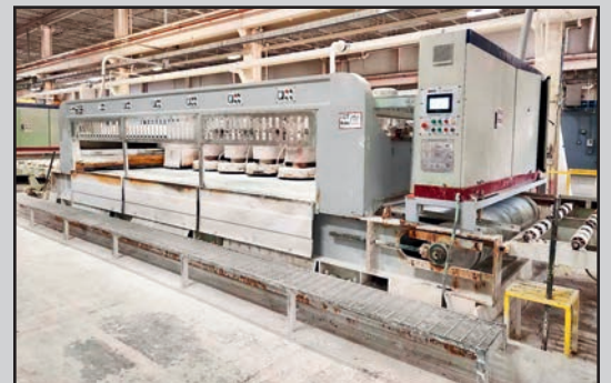
(1 OF 2) 6-HEAD CNC CALIBRATION MACHINES