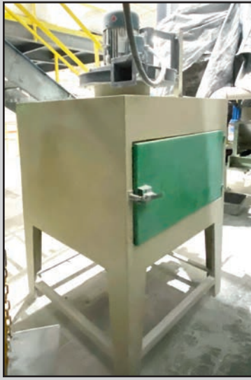
(1 OF 4) BAG HOUSE DUST COLLECTORS