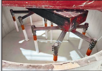
DUAL DRIVE MIXER - INTERIOR

12-Stack Hydraulic Press Curing Oven, with PLC controls, (2) circulating hot water temperature controls.