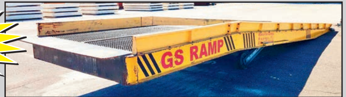
PORTABLE LOADING RAMP