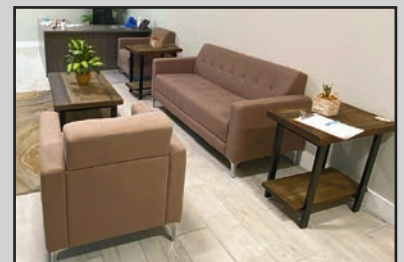
(SAMPLE) HIGH LINE OFFICE FURNITURE

TERMS OF SALE: To be sold in accordance with CRG Terms of Sale as published on our websites and in the auction catalog. A buyer's premium will apply. All Covid-19 safety protocols will be implemented.