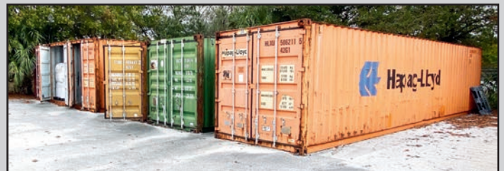
(SAMPLE) 41 ASSORTED STEEL CONTAINERS