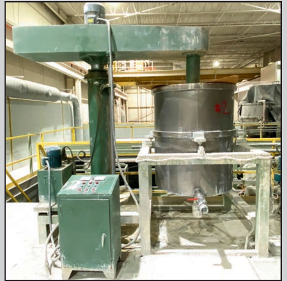
(1 OF 3) STAINLESS STEEL SHEAR MIXER-DISPERSERS