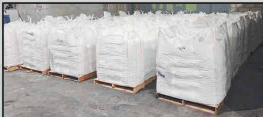
(SAMPLE) BAGGED RAW MATERIAL INVENTORY