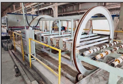
AUTOMATIC TURN-OVER CONVEYOR