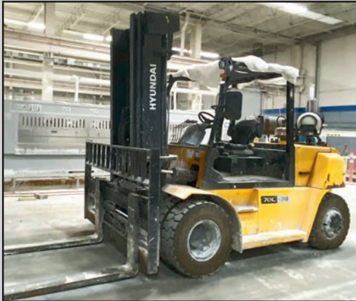
HYUNDAI 13,600-LB. CAPACITY LP FORKLIFT

HYUNDAI 70L-7A Pneumatic Tire LP Forklift, 13,600-lb. capacity, 200" mast with side shift, 1,879 hours.