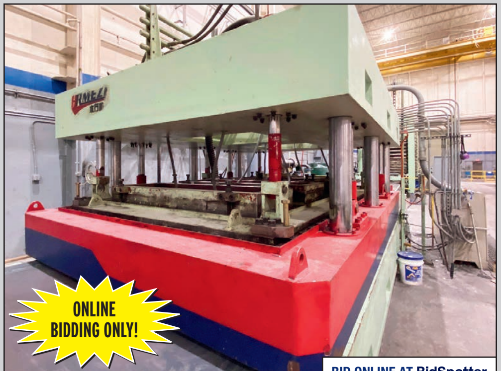
HYDRAULIC VACUUM PRESS