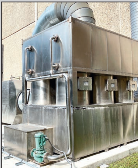
CENTRAL STAINLESS STEEL WET DUST COLLECTION SYSTEM