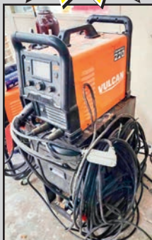
VULCAN OMNI-PRO 220 TIG WELDER