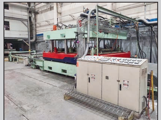
CNC HYDRAULIC VACUUM PRESS (REAR VIEW)