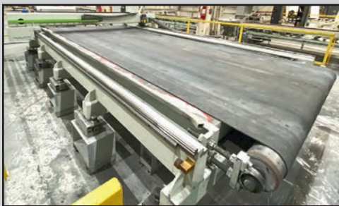
CNC LASER GUIDED DECORATING MACHINE