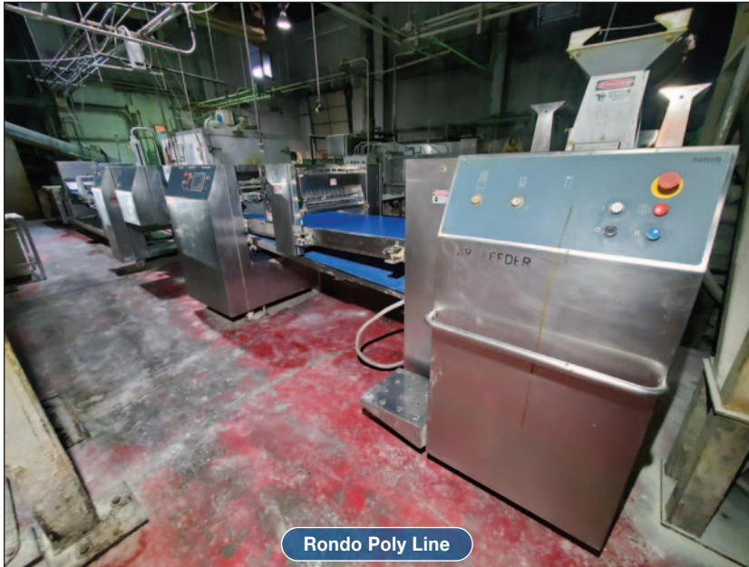
Rondo Poly Line