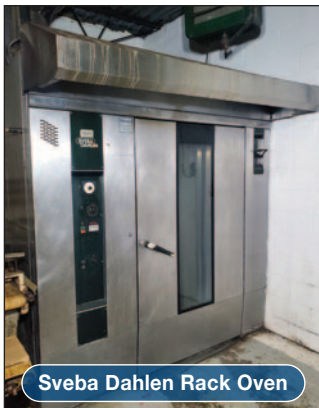
Sveba Dahlen Rack Oven