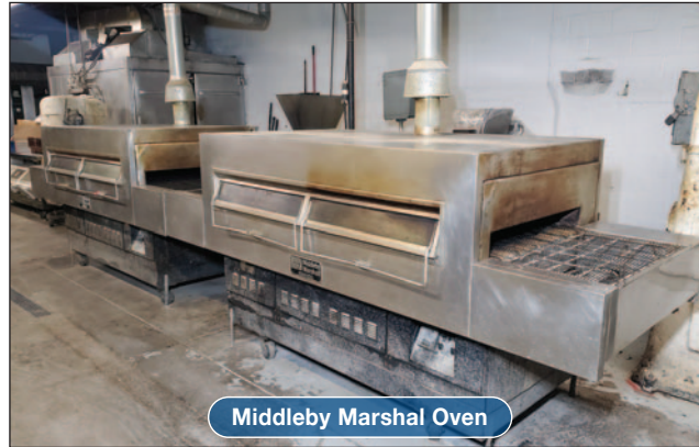
Middleby Marshal Oven