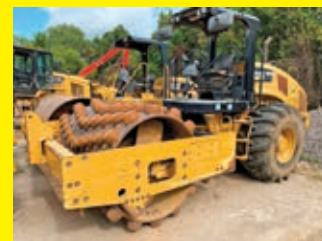
2014 CAT CP56B SN:LHC00480 powered by Cat diesel engine, equipped with OROPS, 84in. padsfoot drum, vibratory drum, drum drive, 23.1-26 rubber, 3,911 hours.