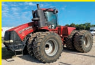
2015 CASE 580HD STEIGER SN:ZEF304123 powered by Case IHPT diesel engine, 580.7hp, equipped with EROPS, air, heat, 16F x 2R full powershift transmission, quad couplers, scraper hitch, front counterweights, 800/70R32 dual tires.