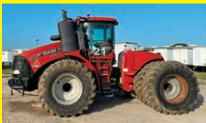
2014 CASE 580HD STEIGER SN:ZEF301382 powered by Case IHPT diesel engine, 580.7hp, equipped with EROPS, air, heat, 16F x 2R full powershift transmission, quad couplers, scraper hitch, front counterweights, 800/70R32 dual tires.