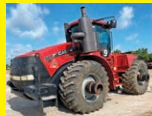
2015 CASE 580HD STEIGER SN:ZFF303958 powered by Case IHPT diesel engine, 580.7hp, equipped with EROPS, air, heat, 16F x 2R full powershift transmission, quad couplers, scraper hitch, front counterweights, 800/70R32 dual tires.