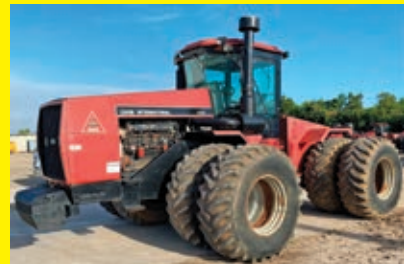
CASE 9280 SN:JEF0032578 powered by Cummins NTA-855-A diesel engine, 375hp, equipped with EROPS, air, heat, quad coupler, 24.5R32 dual tires.