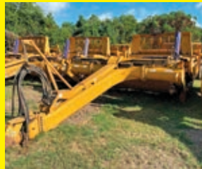
2013 K-TEC 1233 SN:KS2358 equipped with 33 cubic yard capacity, 80,000lb capacity, 12ft. Wide x 4ft. 3in. High x 12ft. 10in. Long, 23.5R25 radial rubber.