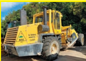
BOMAG MPH122 SN:90061074 4x4, powered by Deutz diesel engine, 482hp, equipped with EROPS, air, heat, 84.5in. Rotor width, 750/65R26 rubber, 3,087 hours.