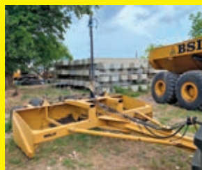
HOLLY 12FT. equipped with 12ft. Width, Topcon, 31x13.5-15 tires.