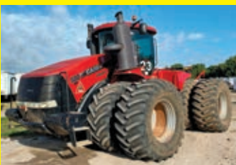
2014 CASE 580HD STEIGER SN:ZEF300561 powered by Case IHPT diesel engine, 580.7hp, equipped with EROPS, air, heat, 16F x 2R full powershift transmission, quad couplers, scraper hitch, front counterweights, 800/70R32 dual tires.