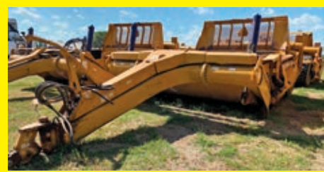
2015 K-TEC 1233 SN:KS2562 equipped with 33 cubic yard capacity, 80,000lb capacity, 12ft. Wide x 4ft. 3in. High x 12ft. 10in. Long, 23.5R25 radial rubber.