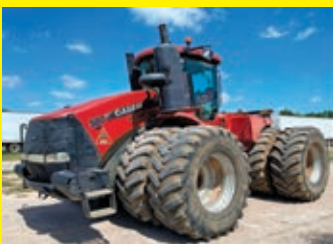
2014 CASE 580HD STEIGER SN:ZEF301517 powered by Case IHPT diesel engine, 580.7hp, equipped with EROPS, air, heat, 16F x 2R full powershift transmission, quad couplers, scraper hitch, front counterweights, 800/70R32 dual tires.