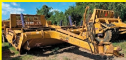
2014 K-TEC 1233 SN:KS2391 equipped with 33 cubic yard capacity, 80,000lb capacity, 12ft. Wide x 4ft. 3in. High x 12ft. 10in. Long, 23.5R25 radial rubber.