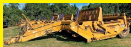
2015 K-TEC 1233 SN:KS2510 equipped with 33 cubic yard capacity, 80,000lb capacity, 12ft. Wide x 4ft. 3in. High x 12ft. 10in. Long, 23.5R25 radial rubber.