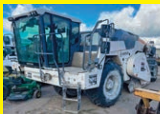
2018 WIRTGEN WR200XL SN:09WR0143 4x4, powered by diesel engine, 429hp, equipped with cab, air, 7ft 10in working width, 19in working depth, 23.1R26 rubber, 1,968 hours.