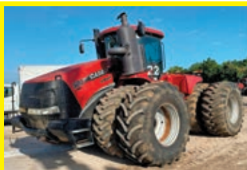
2014 CASE 580HD STEIGER SN:ZEF300578 powered by Case IHPT diesel engine, 580.7hp, equipped with EROPS, air, heat, 16F x 2R full powershift transmission, quad couplers, scraper hitch, front counterweights, 800/70R32 dual tires.