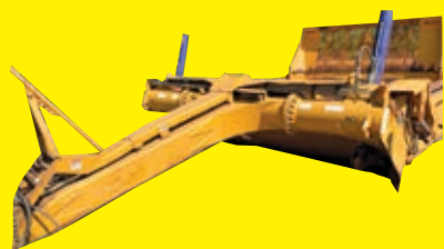
2014 K-TEC 1233 SN:KS2406 equipped with 33 cubic yard capacity, 80,000lb capacity, 12ft. Wide x 4ft. 3in. High x 12ft. 10in. Long, 23.5R25 radial rubber.