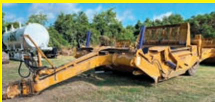
2014 K-TEC 1233 SN:KS2390 equipped with 33 cubic yard capacity, 80,000lb capacity, 12ft. Wide x 4ft. 3in. High x 12ft. 10in. Long, 23.5R25 radial rubber.