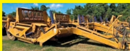
2014 K-TEC 1233 SN:KS2374 equipped with 33 cubic yard capacity, 80,000lb capacity, 12ft. Wide x 4ft. 3in. High x 12ft. 10in. Long, 23.5R25 radial rubber.