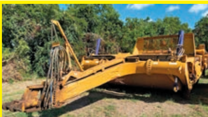
2014 K-TEC 1233 SN:KS2385 equipped with 33 cubic yard capacity, 80,000lb capacity, 12ft. Wide x 4ft. 3in. High x 12ft. 10in. Long, 23.5R25 radial rubber.