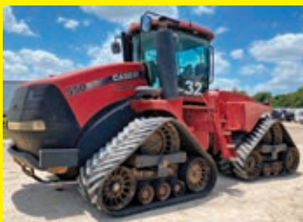
CASE 550 QUAD TRAC SN:ZBF128254 powered by diesel engine, 549.9hp, equipped with EROPS, air, heat, 16/FX2R full powershift transmission, 30in. Rubber tracks, quad coupler, front counterweights..