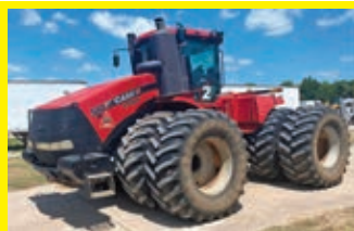
2015 CASE 580HD STEIGER SN:ZFF304096 powered by Case IHPT diesel engine, 580.7hp, equipped with EROPS, air, heat, 16F x 2R full powershift transmission, quad couplers, scraper hitch, front counterweights, 800/70R32 dual tires.