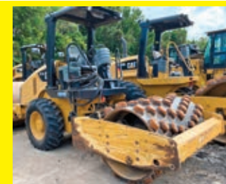
2013 CAT CP44 SN:MPC00223 powered by Cat diesel engine, equipped with OROPS, 66in. padsfoot drum, vibratory drum, drum drive, 14.9-24 rubber, 2,949 hours.