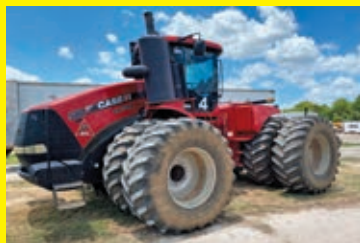
2014 CASE 580HD STEIGER SN:ZEF301428 powered by Case IHPT diesel engine, 580.7hp, equipped with EROPS, air, heat, 16F x 2R full powershift transmission, quad couplers, scraper hitch, front counterweights, 800/70R32 dual tires.