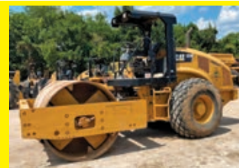
2014 CAT CS56B SN:L8H00847 powered by Cat diesel engine, equipped with OROPS, 84in. Smooth drum, vibratory drum, drum drive, 23.1-26 rubber, 3,880 hours.