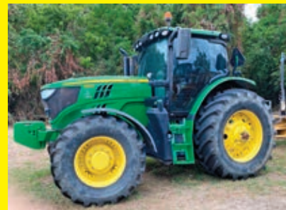
JOHN DEERE 6155R VN:1BW615SRJD028629 powered by John Deere diesel engine, equipped with EROPS, 3pt hitch, PTO, front counterweights, 540/65R28 front rubber, 650/65R38 rear rubber.