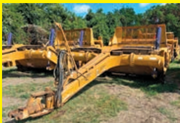
2014 K-TEC 1233 SN:KS2392 equipped with 33 cubic yard capacity, 80,000lb capacity, 12ft. Wide x 4ft. 3in. High x 12ft. 10in. Long, 23.5R25 radial rubber.