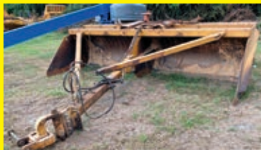
NAMMCO SN:1723 equipped with 15ft. Width, hydraulic tire raise, 425/65R22.5 rubber.