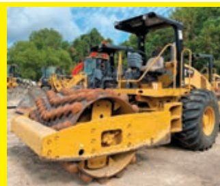
CAT CP56B SN:C5P00209 powered by Cat diesel engine, equipped with OROPS, 84in. padsfoot drum, vibratory drum, drum drive, 23.1-26 rubber.