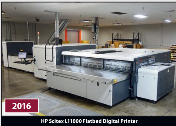
HP Scitex L11000 Flatbed Digital Printer