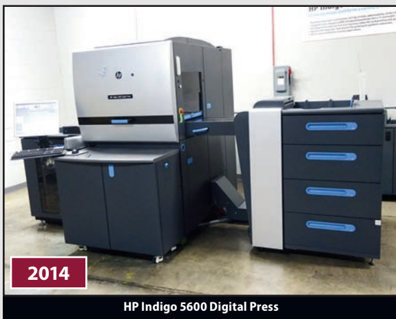
HP Indigo 5600 Digital Press