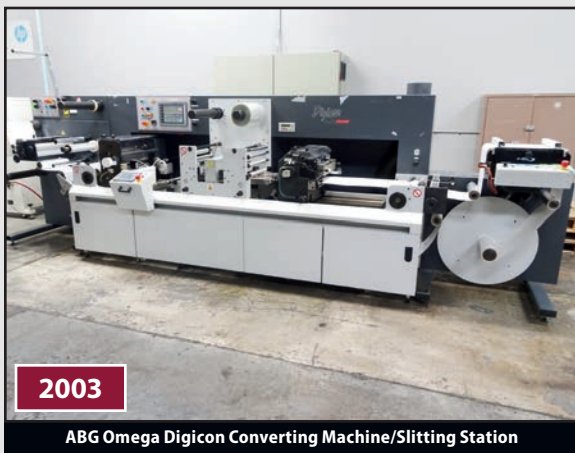
ABG Omega Digicon Converting Machine/Slitting Station