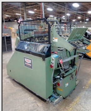
Kluge EHD14X22 Die Cutter and Foil Stamper