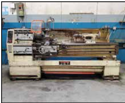
JET 1660-3PGH Geared Head Engine Lathe