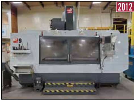
2012 HAAS VF 9/50 CNC Vertical Machining Center