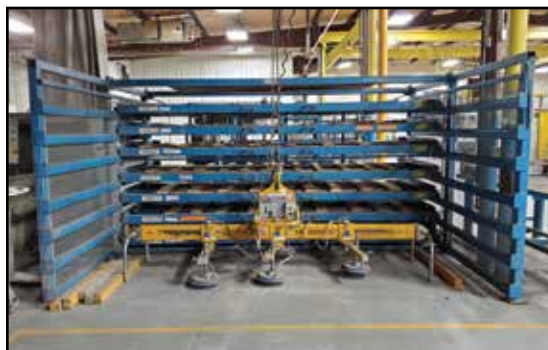
HD Steel Sliding Shelf Rack