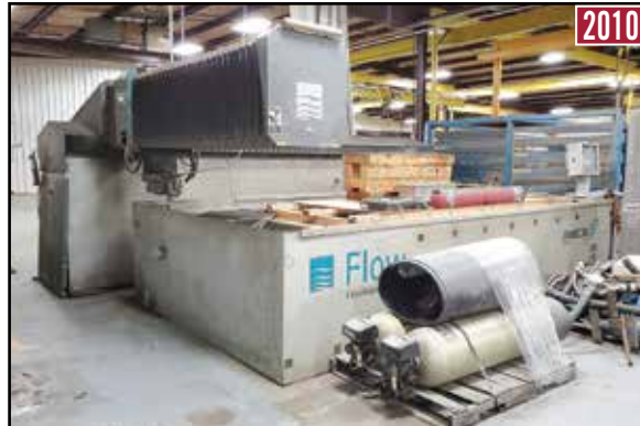
FLOW Hyperjet 50 Mach 3 4020B Water Jet Cutting Table