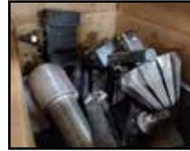
Large Assortment of Tooling, Angle Machine Blocks, Vises, Tool Holders & More