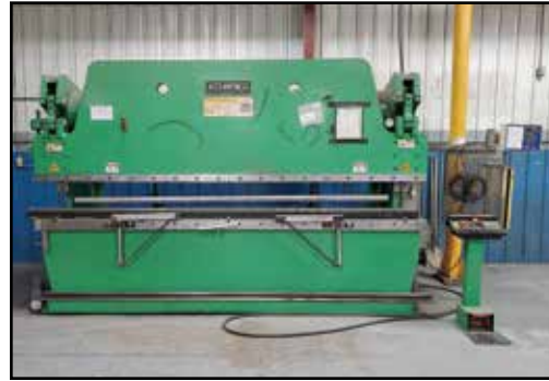
ACCURPRESS 175-Ton x 12' Press Brake