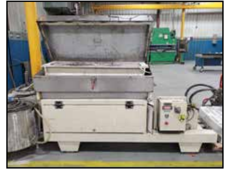
Horizontal Media Finish Tumbler