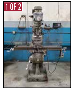
1 OF 2 (2) SHARP Vertical Mills