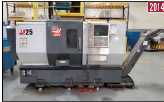
2014 HAAS ST-25 CNC Turning Center