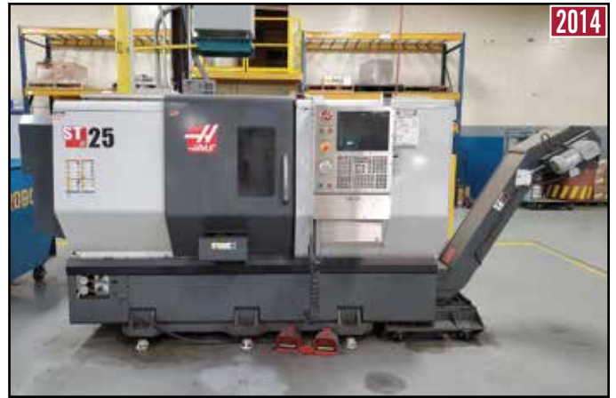
HAAS ST-25 CNC Turning Center