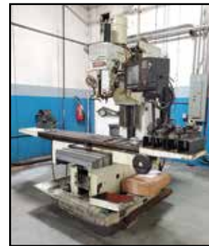
FRYER MB-15 Vertical Mill