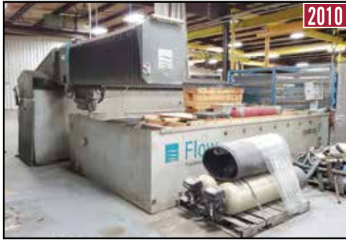
2010 FLOW Hyperjet 50 Mach 3 4020B Water Jet Cutting Table