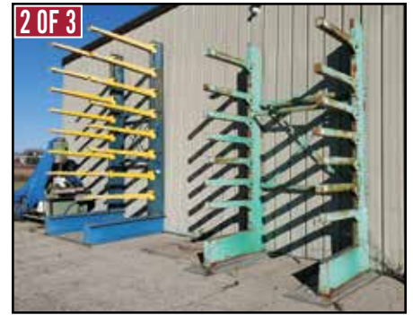
(3) Cantilever Racks