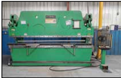
ACCURPRESS 175-Ton x 12' Press Brake

PRESORTED FIRST CLASS MAIL U.S. POSTAGE PAID CINCINNATI, OH PERMIT NO. 5714