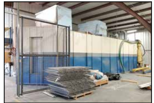
30' x 12' Abrasive Blast Booth w/EMPIRE PRS-62 Blast Pod System