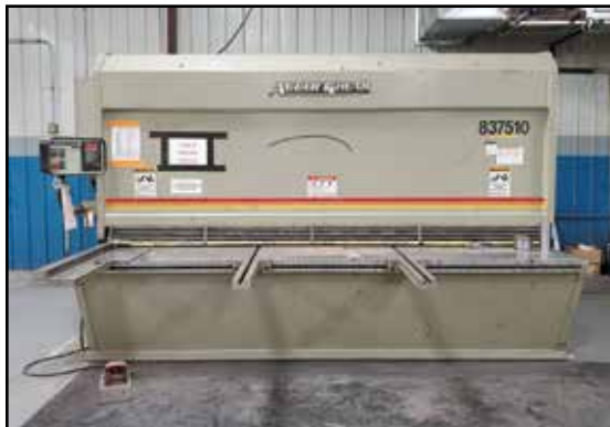
ACCUR SHEAR .375" x 10' Hyd. Shear