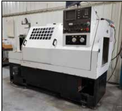
DELTA CNC Lathe