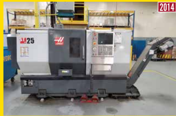
HAAS ST-25 CNC Turning Center

Auction conducted by: MYRON BOWLING AUCTIONEERS, INC. P. O. Box 369, Ross, Ohio 45061