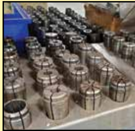
Assorted Tooling & Tool Holders