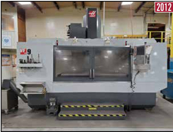
HAAS VF 9/50 CNC Vertical Machining Center