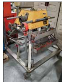
Power Pipe Threader on Stainless Cart