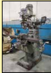
(2) SHARP Vertical Mills