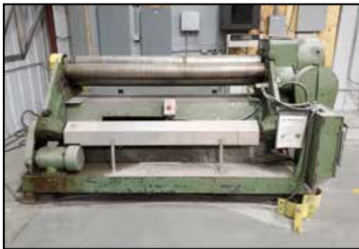
WYSONG 5' Power Pinch Roller