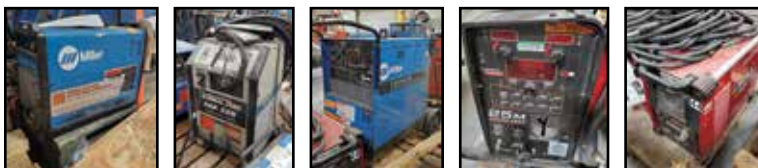
(20) MILLER, LINCOLN, THERMAL ARC, PRO-WELD & KLUTCH Welders & Plasma Cutter