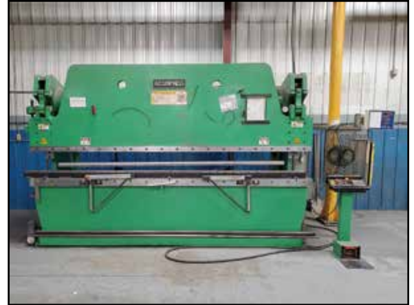
ACCURPRESS 175-Ton x 12' Press Brake

Inspection: Day Prior to Auction from 9AM-4PM