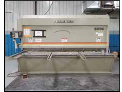
ACCUR SHEAR .375" x 10' Hyd. Shear