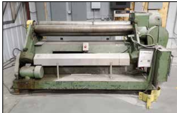
WYSONG 5' Power Pinch Roller