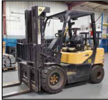
DAEWOO G30S-3 6,000-lb Forklift