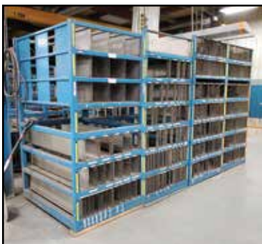
HD Steel Parts Racks w/SS Dividers