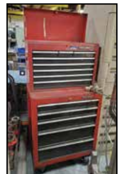
CRAFTSMAN Rolling Toolboxes