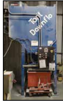
DONALDSON TORIT DFT3-18 Dust Collector