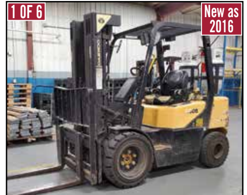
(6) HYSTER, YALE & DAEWOO Forklifts to 12,000-lb. Capacity