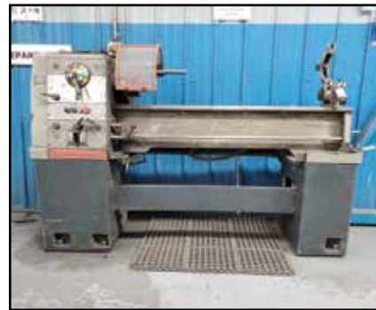
CLAUSING-COLCHESTER 13" x 55" Engine Lathe