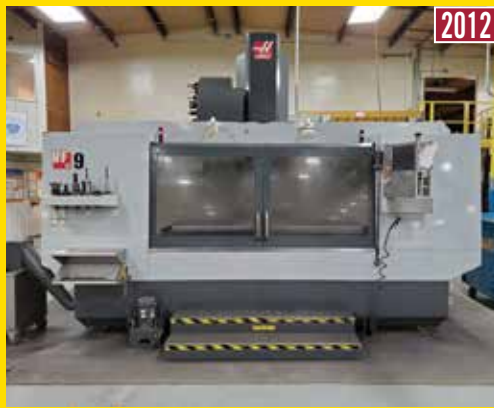
HAAS VF 9/50 CNC Vertical Machining Center

Inspection: Day Prior to Auction From 9AM-4PM