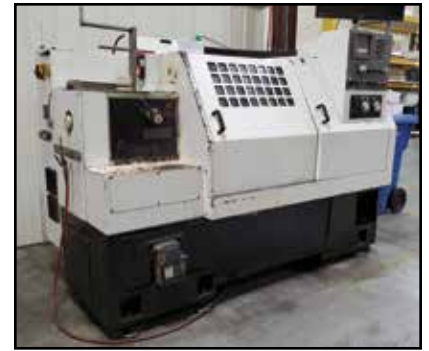
DELTA CNC Lathe