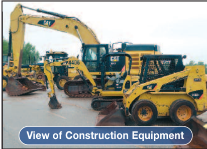
View of Construction Equipment