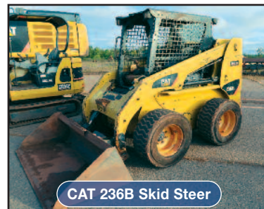
CAT 236B Skid Steer