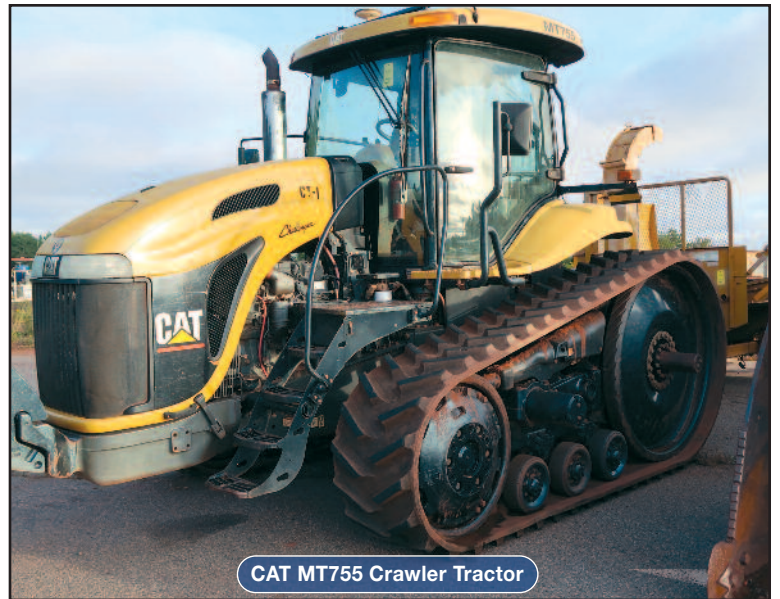
CAT MT755 Crawler Tractor