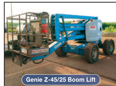
Genie Z-45/25 Boom Lift

Register to Bid Online at: www.pplauctions.com