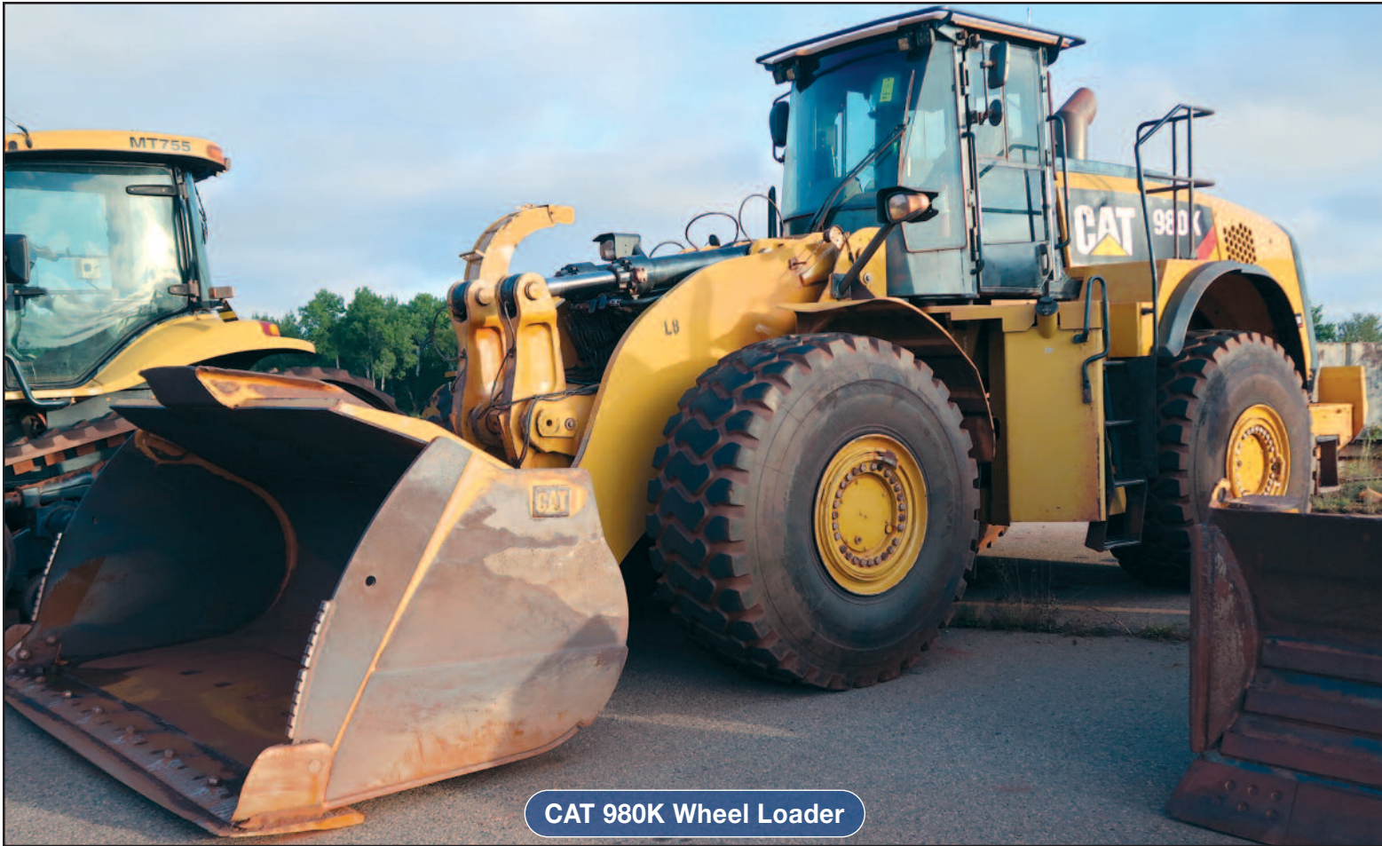
CAT 980K Wheel Loader