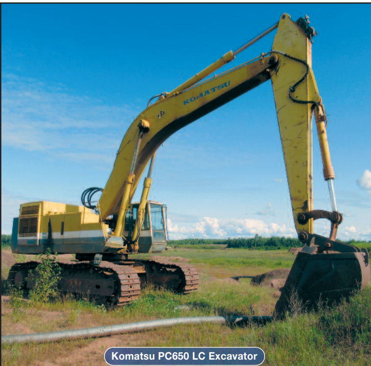
Komatsu PC650 LC Excavator