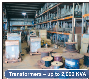
Transformers - up to 2,000 KVA