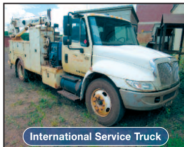
International Service Truck