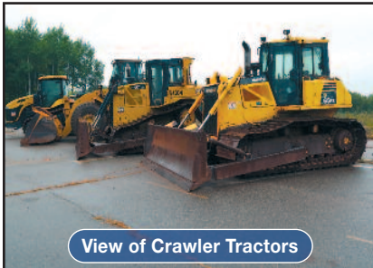
View of Crawler Tractors

ATTENTION: PLANT MANAGER OR MACHINERY BUYER