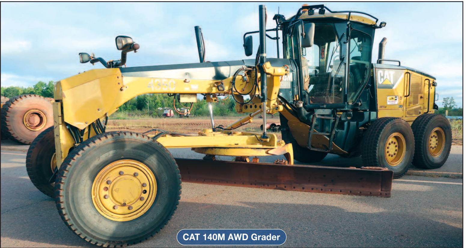
CAT 140M AWD Grader