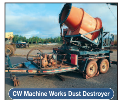
CW Machine Works Dust Destroyer

PLEASE VISIT OUR WEBSITE FOR COMPLETE TERMS & CONDITIONS www.pplauctions.com