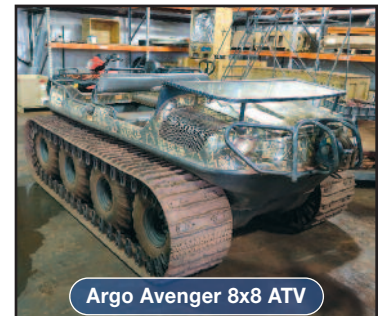
Argo Avenger 8x8 ATV