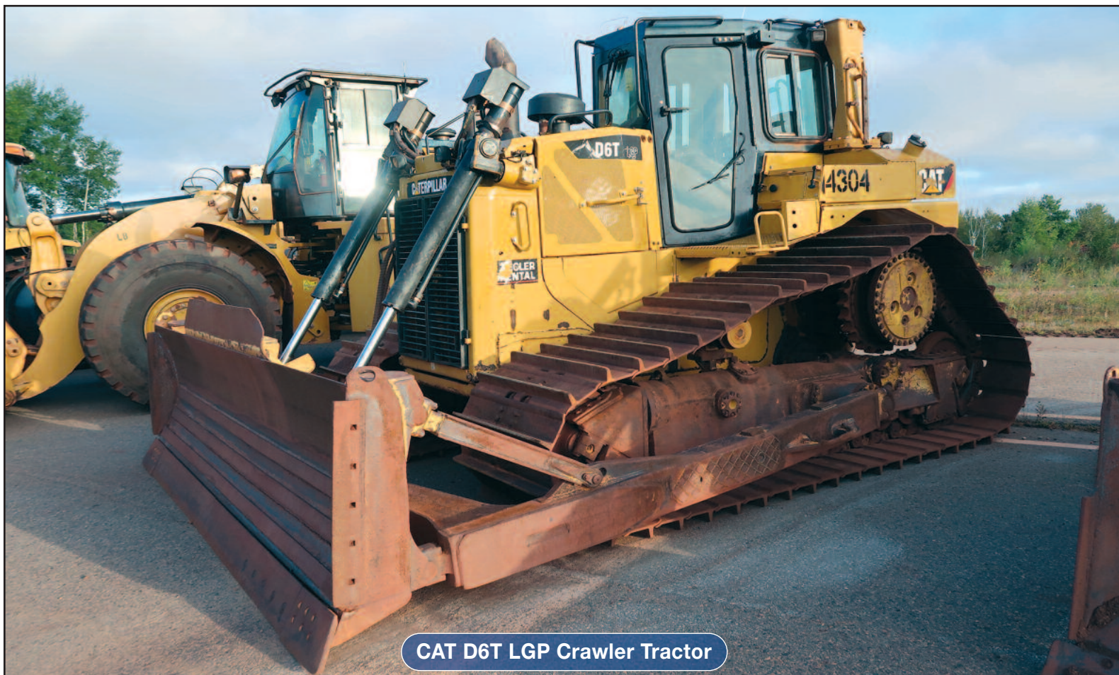
CAT D6T LGP Crawler Tractor

View Equipment Videos at: www.pplauctions.com