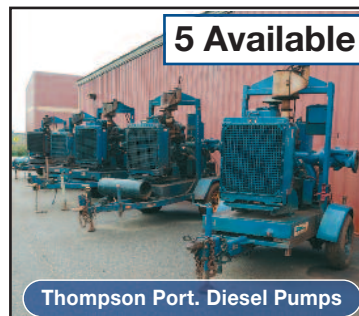
Thompson Port. Diesel Pumps