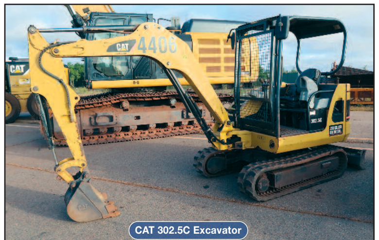
CAT 302.5C Excavator