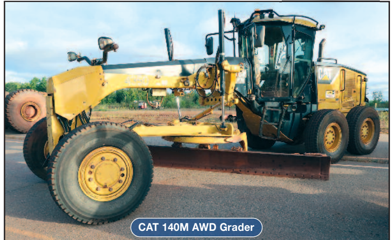
CAT 140M AWD Grader