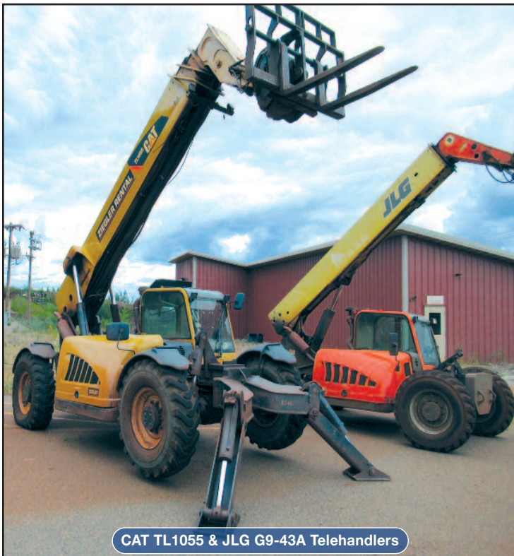
CAT TL1055 & JLG G9-43A Telehandlers