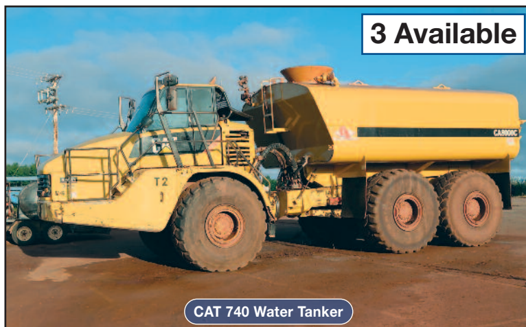
CAT 740 Water Tanker