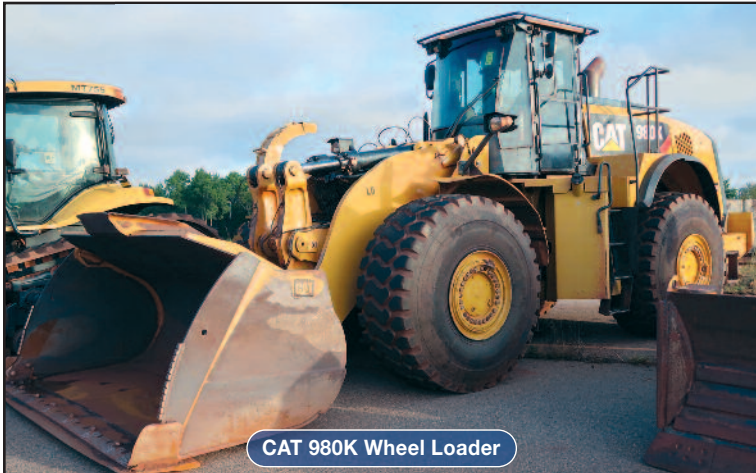
CAT 980K Wheel Loader