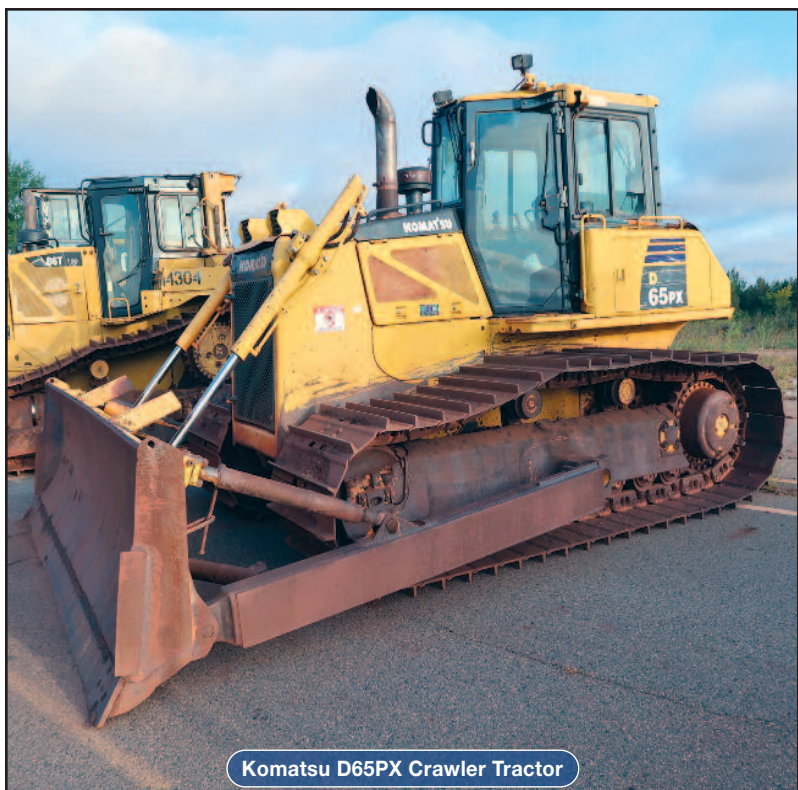
Komatsu D65PX Crawler Tractor

International Service Truck, Liftmoore Boom Crane CAT 236B Skid Steer, 72" GP Bucket