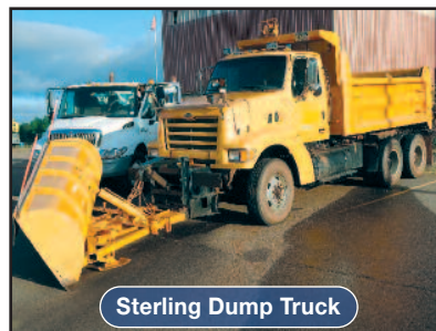
Sterling Dump Truck